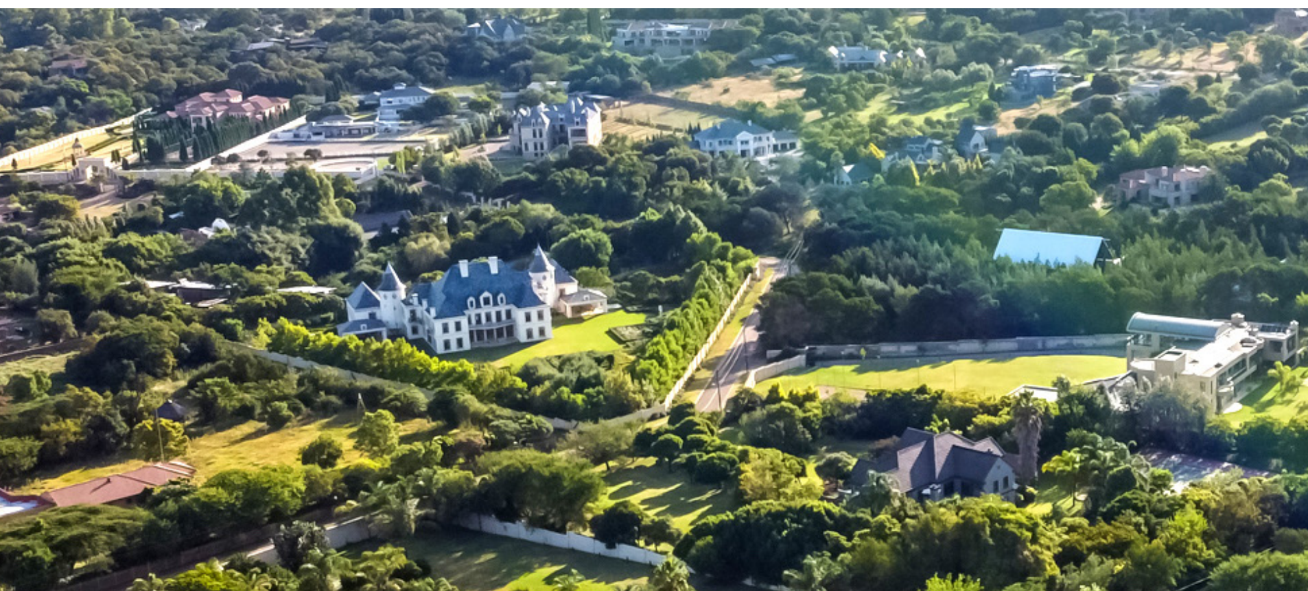
ASKING PRICE USD$ 2.5mil